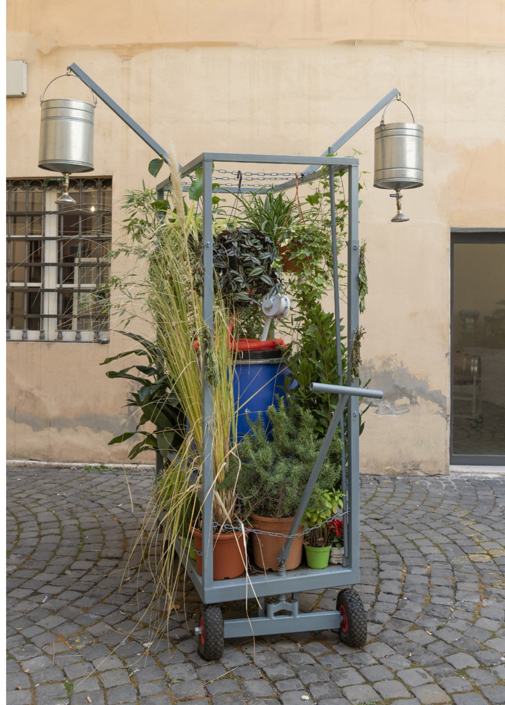
View of the installation at Magazzino, Rome