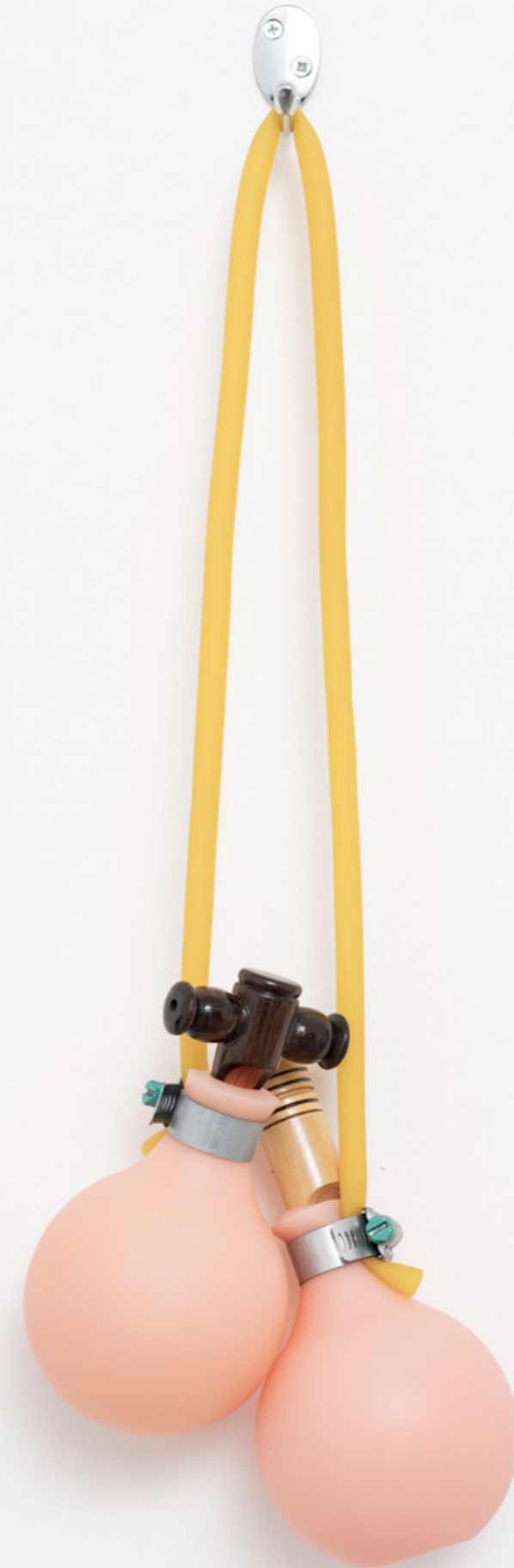
Detail of the installation