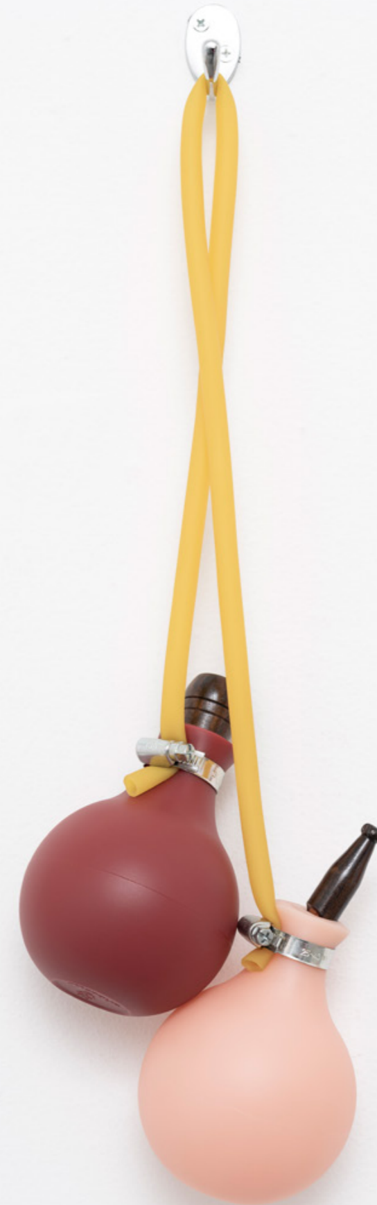
Detail of the installation