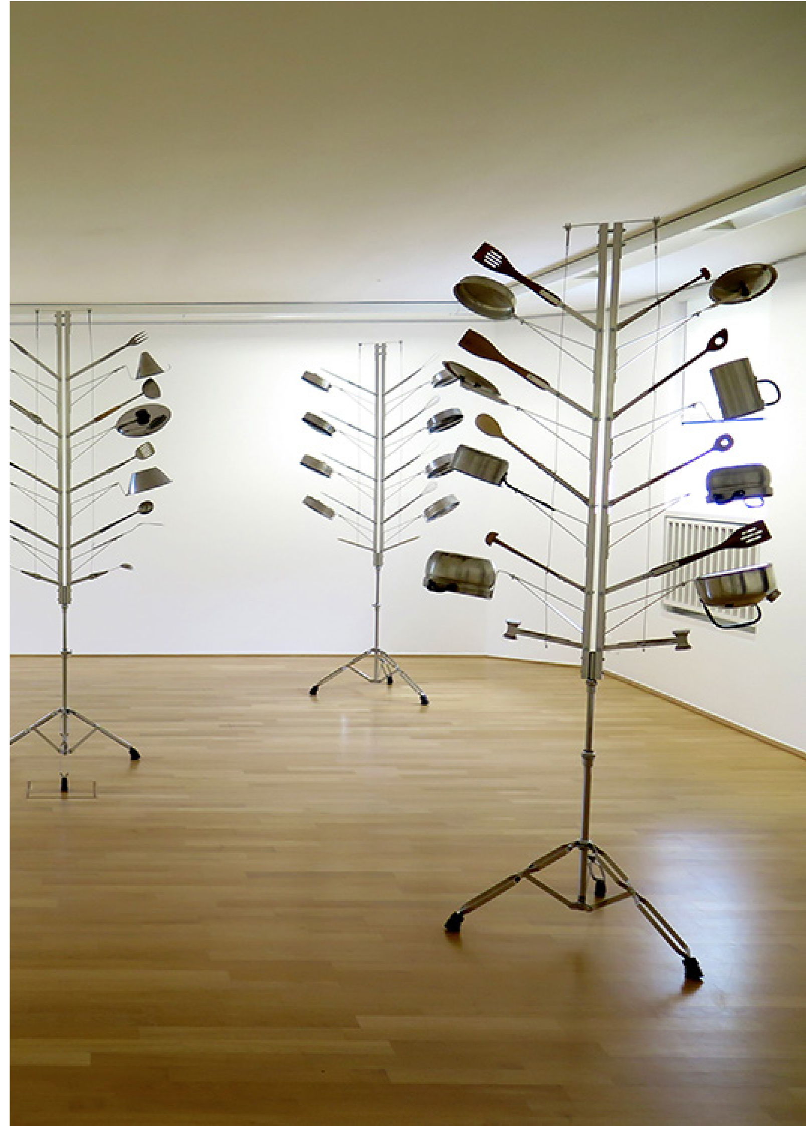
Installation view at Museum Morsbroich Leverkusen, Germany

Flora Treme is a series of relational devices inspired in an unusual musical instrument as well as in a domestic, cosmopolitan and political use of the saucepan. The kitchen utensils so fundamental to the confection of our meal rituals are here played to reflect on other cultural aspects such as the Brazilian popular music, the samba and those who occupy the kitchen space, as well as in ideas that permeates feminist and political protest practices. The public is strongly encouraged to incorporate the experience playing the devices as they please. The title speaks of a tree like structure that trembles according to the one playing it but is also an anagram to the most recent and spread protest words in Brazil since Michel Temer occupied the presidency in a coupist congress maneuver: FORA TEMER! (Dump Temer!)