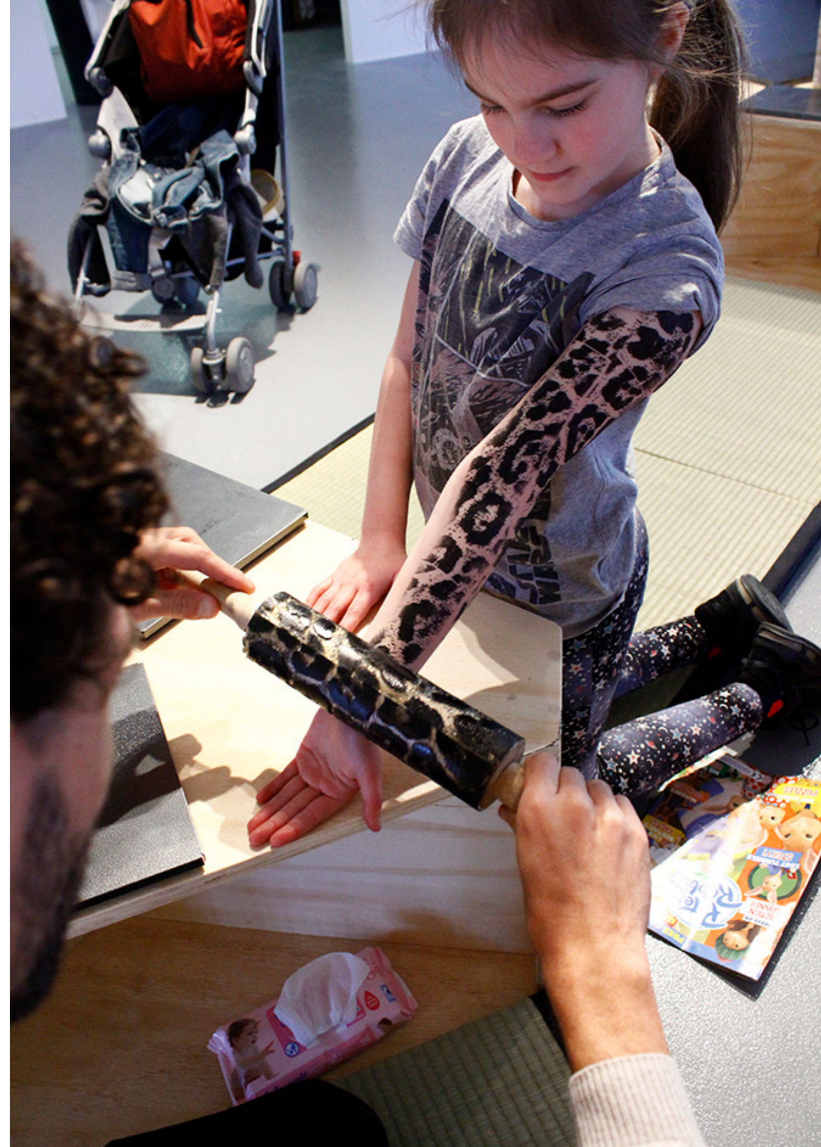
Performance view at TATE Liverpool, Liverpool