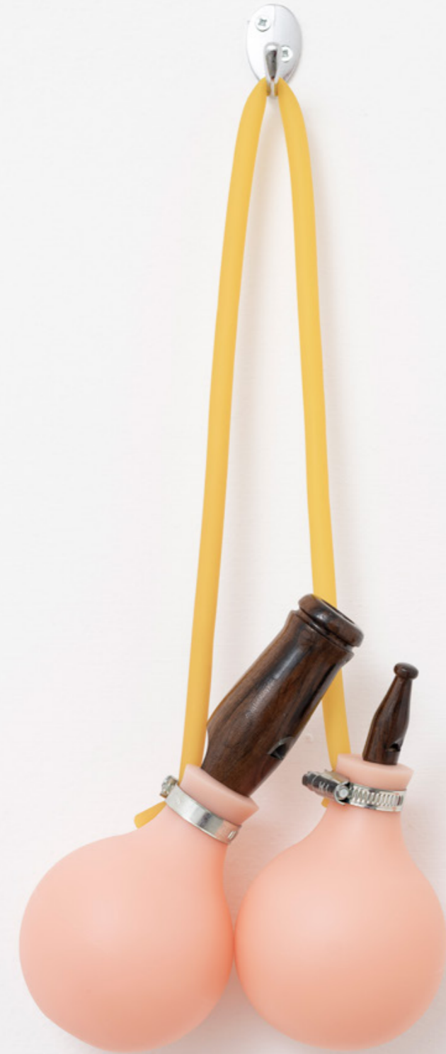
Detail of the installation