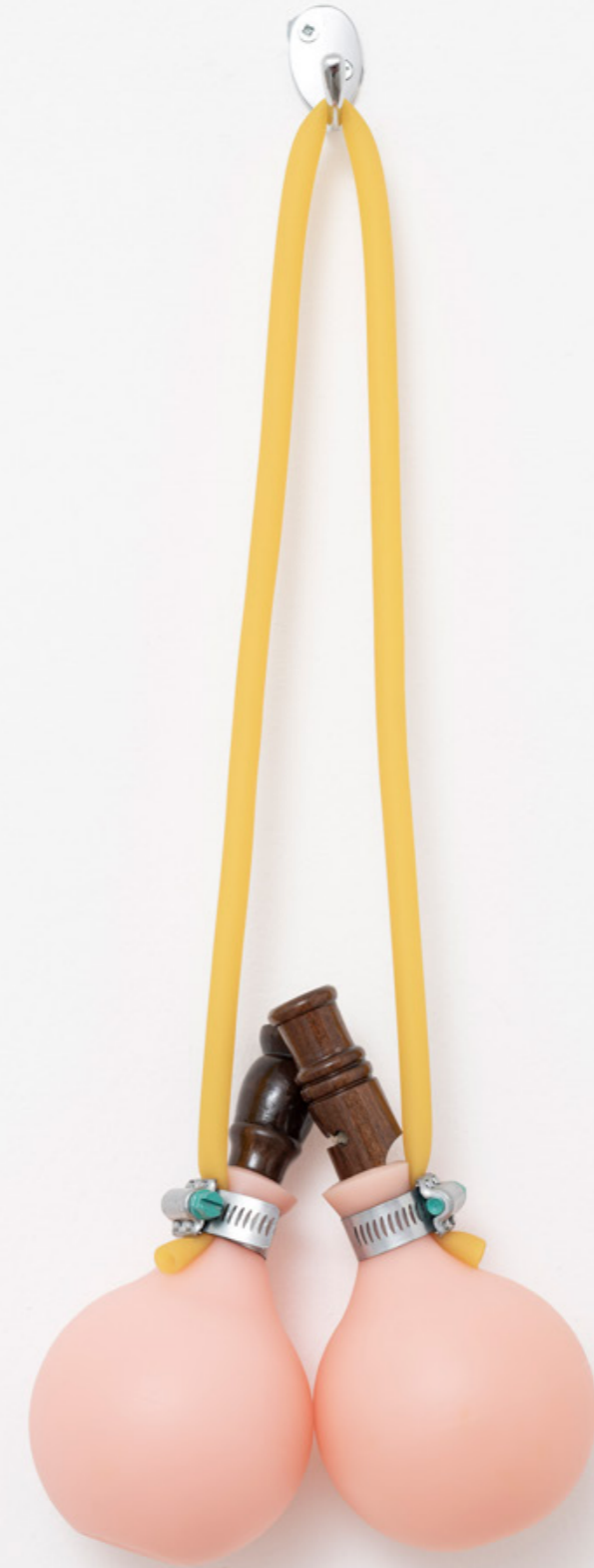
Detail of the installation