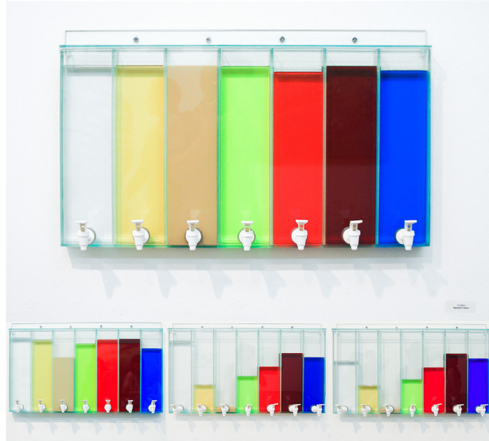
Installation view at Galeria Oscar Cruz

Colorbar is an ethyl device that emanates colors and flavors. On one wall, everyone is invited to sample self-serve drinks in a numbing action that will eventually leave several pictorial trails.