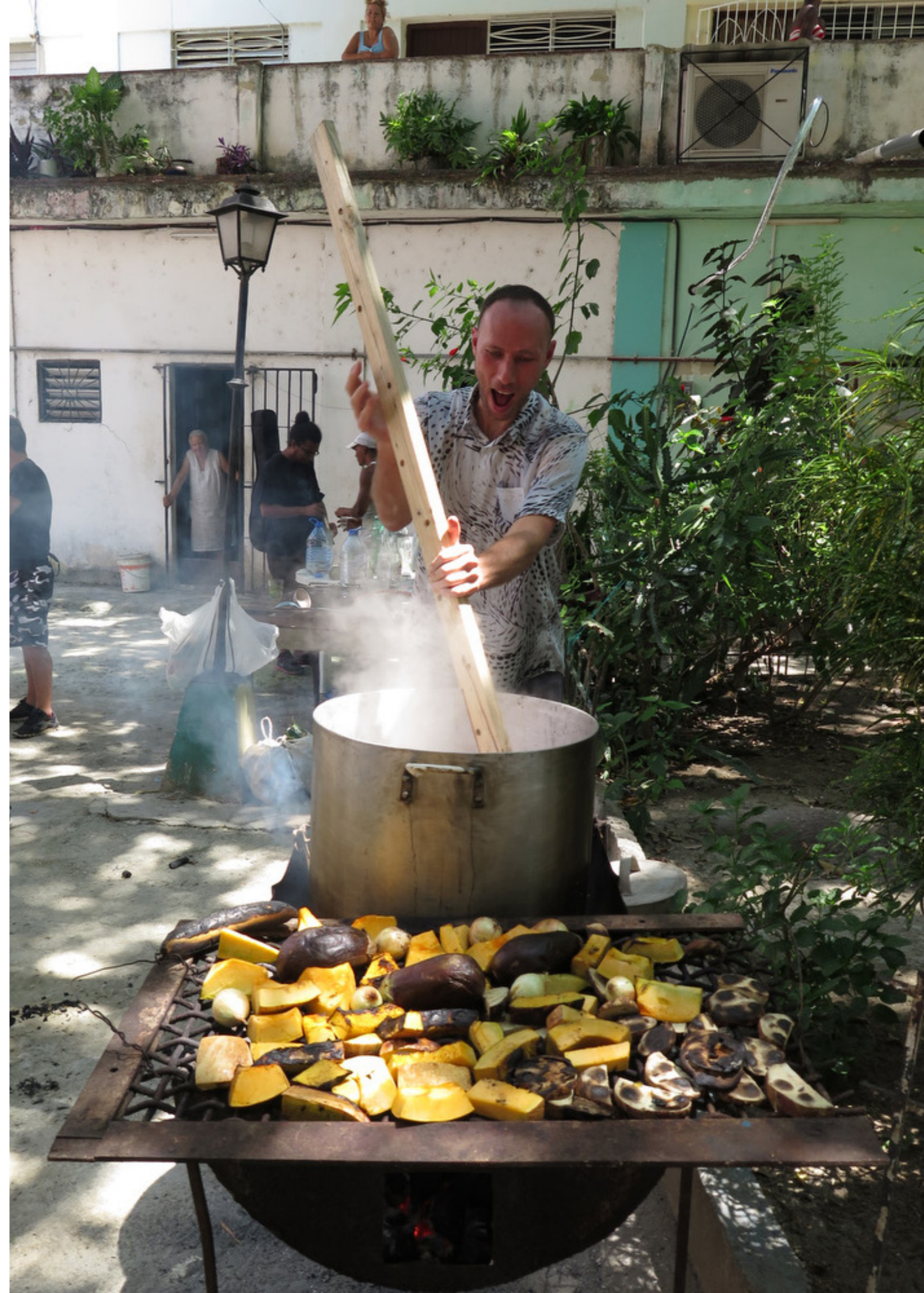
Installation view at 12 Bienal de La Havana La Havana, Cuba

For the 12 Havana Bienal OPAVIVARÁ! created another collective kitchen at the Solar La California an historical city building. With the aid of the picnic Skirt the artists invited the locals to stay and cook together.