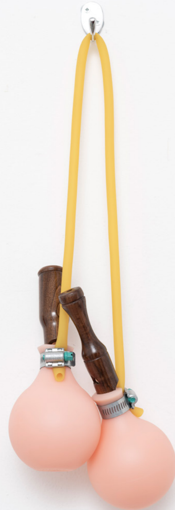
Detail of the installation