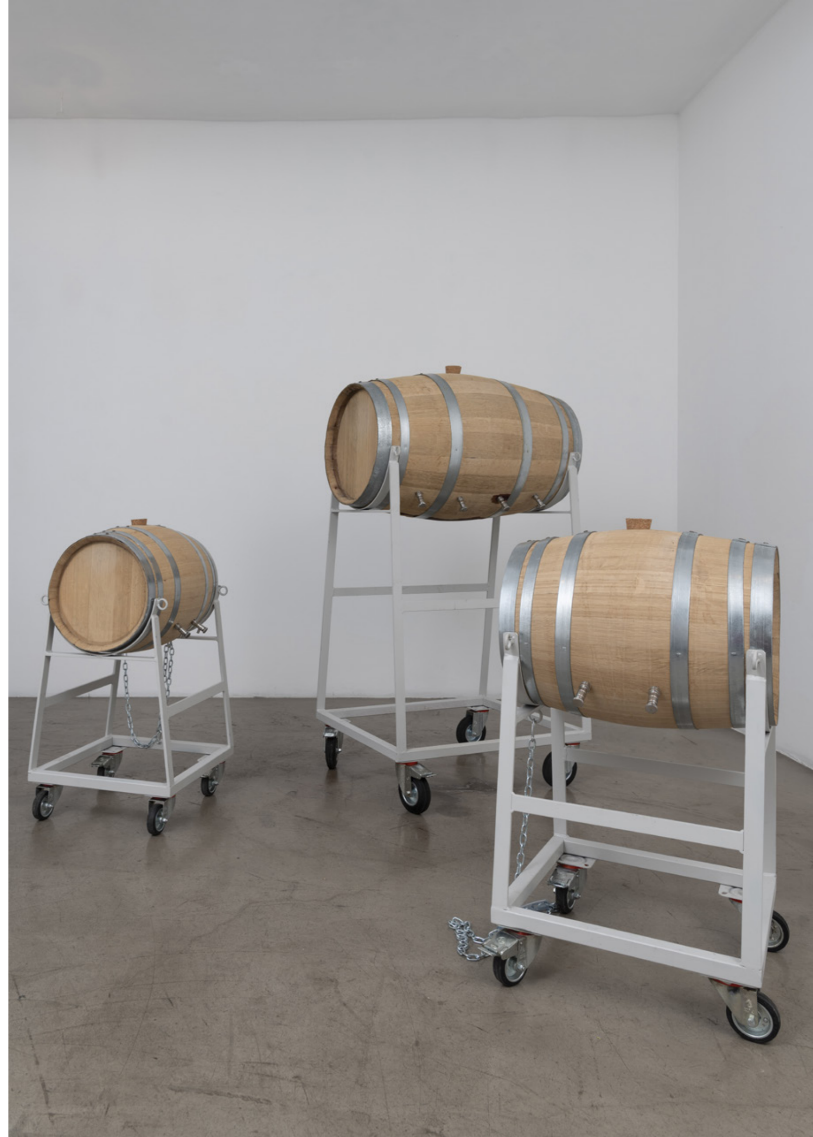
View of the installation at Magazzino, Rome 2019

One element 140 x 78 x 60 cm, two elements 87 x 46 x 46 cm